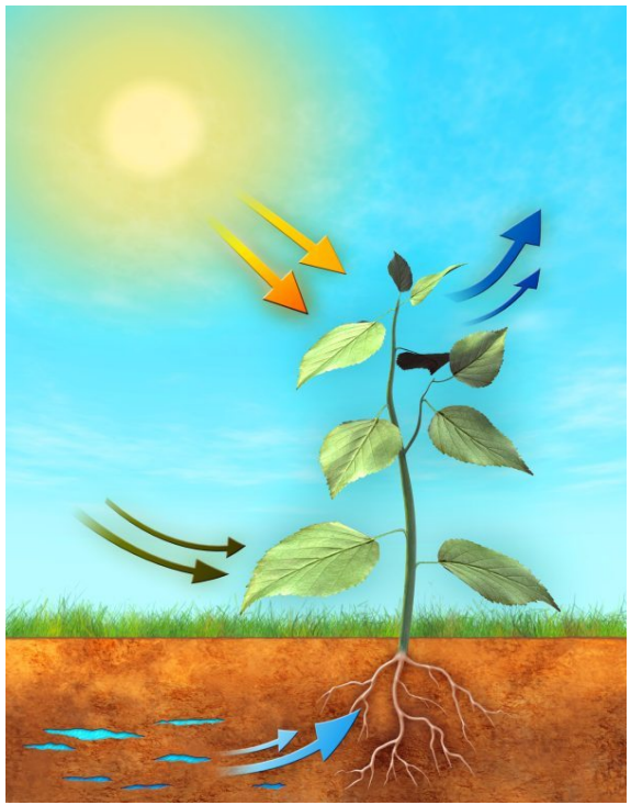
Figure 2. Natural photosynthesis

• In the second phase - independent of light the plants absorb carbon dioxide from the atmosphere and with the help of an army of enzymes, in a complex chain of operations, build, from the carbon extracted from CO2, carbohydrates such as sucrose or starch and based on them, other and other organic substances such as cellulose (the material of which, for the most part, the plant cell wall is composed), and fat (there are many oilproducing plants) or amino acids, the chemical "blocks" of which proteins are made of.